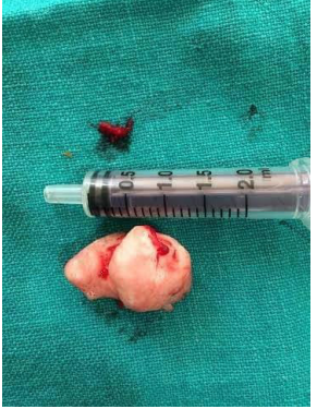
Fig. 4: Gross Pathology