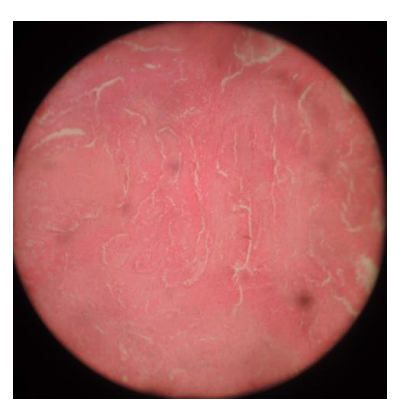
Fig. 5: H&E x5