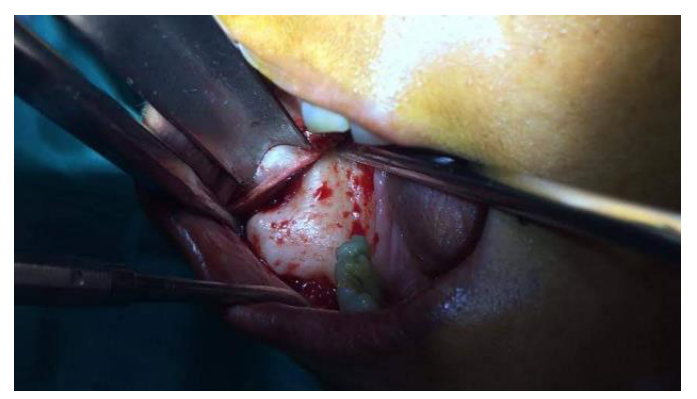
Fig. 3: Intraoral exposure of osteoma